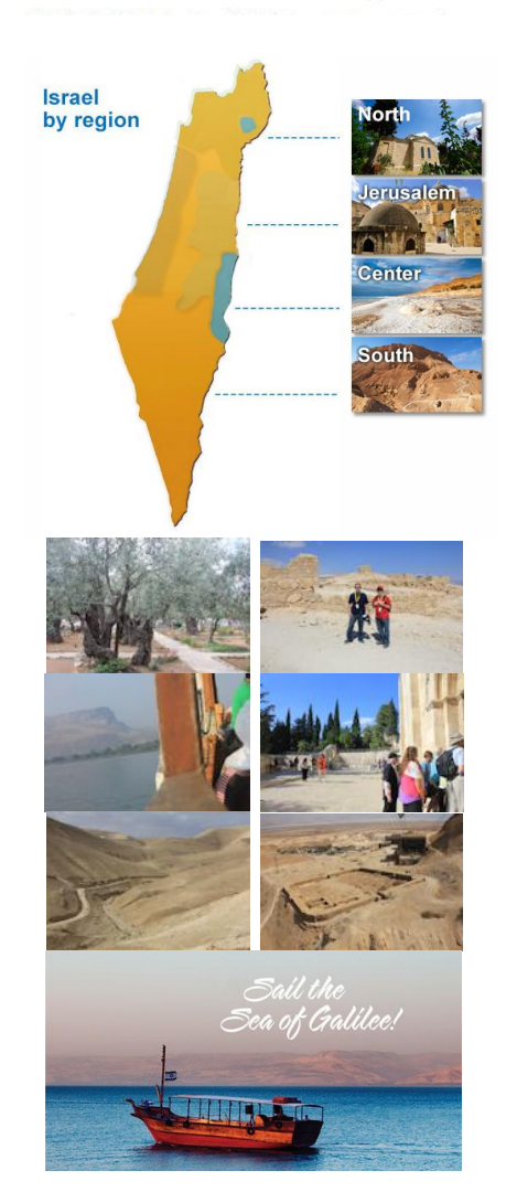
Bible Christian Church Le Grand, CA http://www.bcclegrand.com

Come and Make Memories as we worship and study God's Word in His Land.